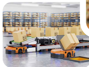
Autonomous Mobile Robots