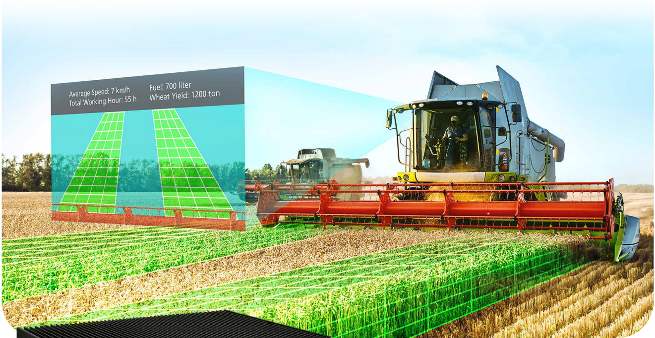
Automated Agricultural Machinery

NVIDIA® Jetson AGX Orin™ Embedded AI Computing System