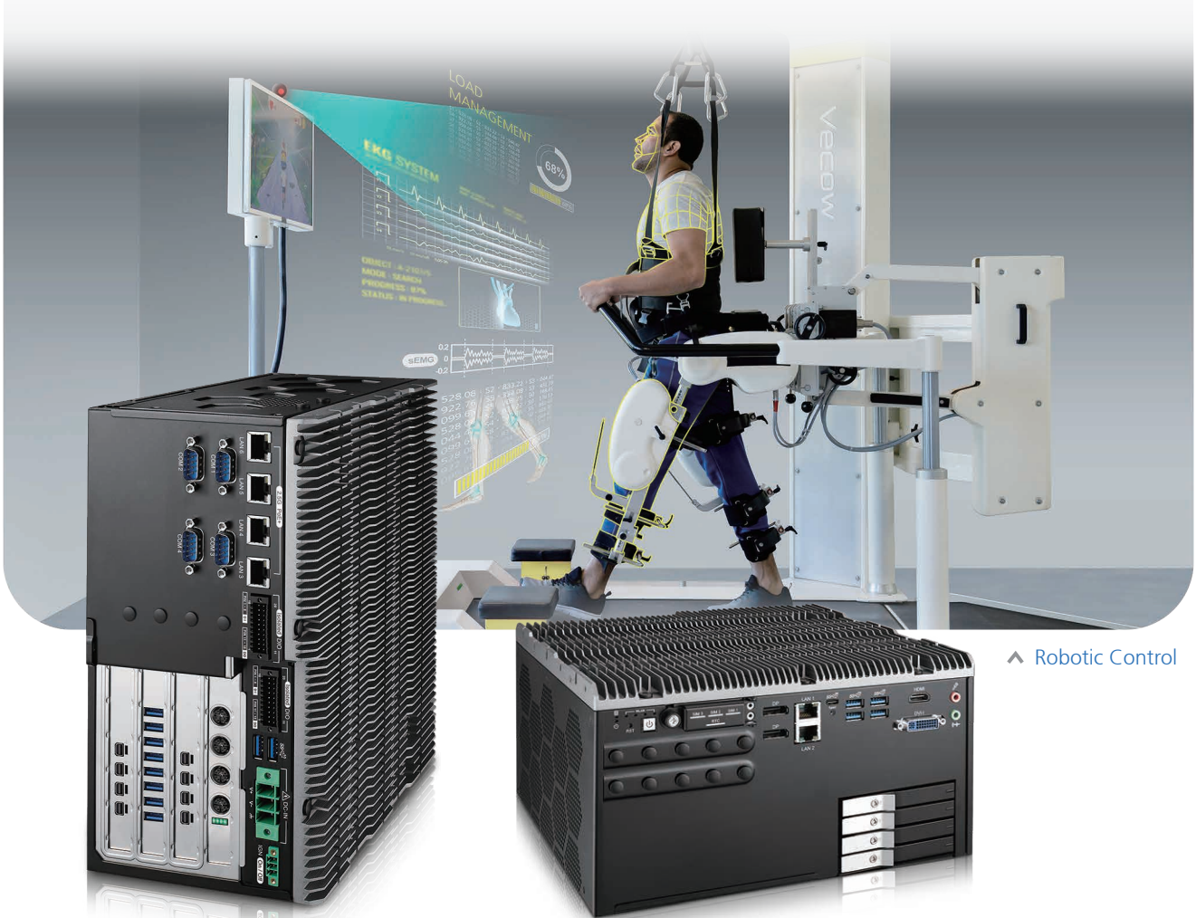
^ Robotic Control

Intel® Core™ i9/i7/i5/i3 Processor (14th Gen) Flexible AI Inference Workstation