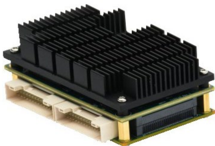
EPS-12000-CM with heat sink