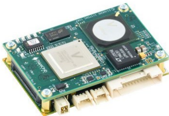
EPS-12000-CM without thermal solution