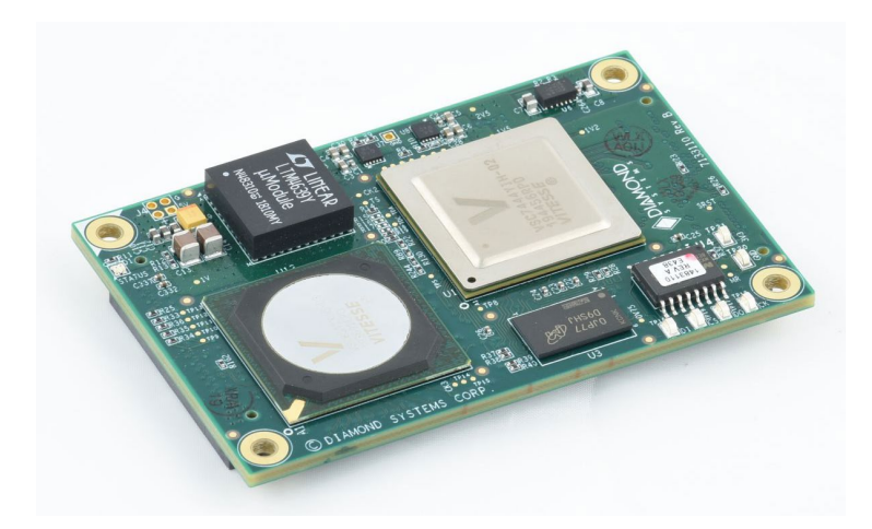
EPSM-10GX Ethernet Switch Module