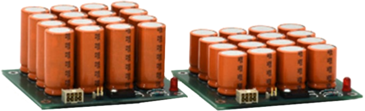
SEP-7002-CC (left), SEP-7001-CC (right)