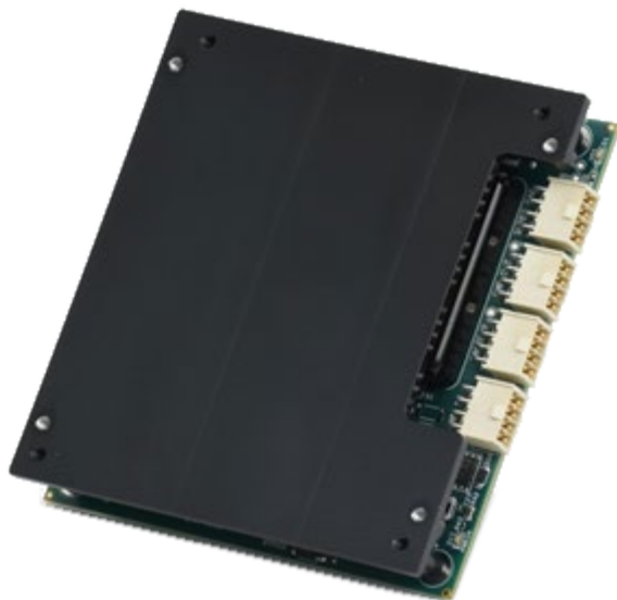
JMM-7000 showing integrated heat spreader mounting plate