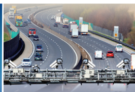
ITS (Intelligent Transportation System)