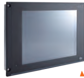
▲ Touch without keypad version